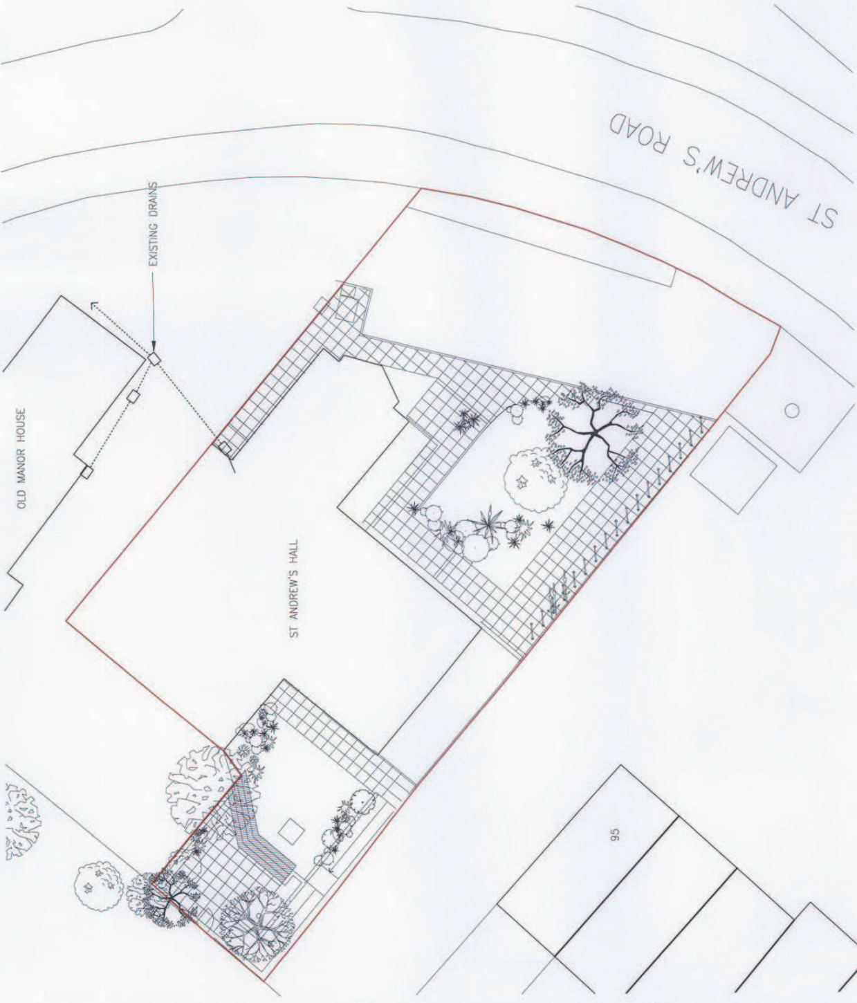
SITE/BLOCK PLAN 1:200